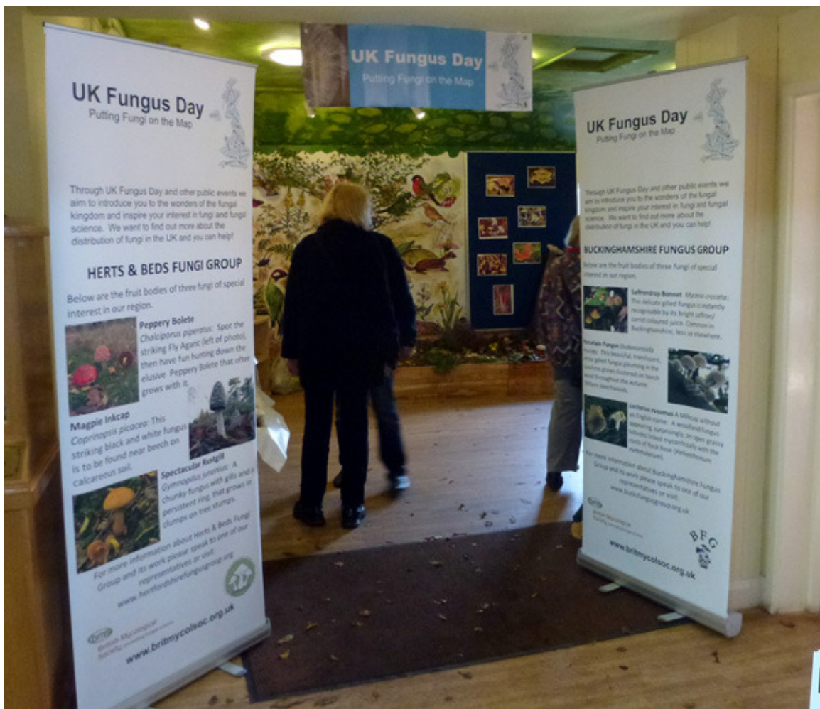
The entrance to the display, framed by our two group banners.

Ashridge was the ideal venue for this event: a SSSI site half in Bucks, half in Herts, a large expanse of mature mixed woodland with good grassland areas too, also a very popular destination for recreation having car parks and excellent facilities including a café and shop within the NT building complex where our display was to be held. Planning for this our most ambitious event by far started over six months ago, involving meetings and many emails for the six of us involved - three from each group, putting together the design, logistics and contents for the display under the leadership of Steve Kelly, our enthusiastic and tireless organiser. This was our joint contribution to National Fungus Day, for which the BMS provided our banners to adorn the entrance, seen below.