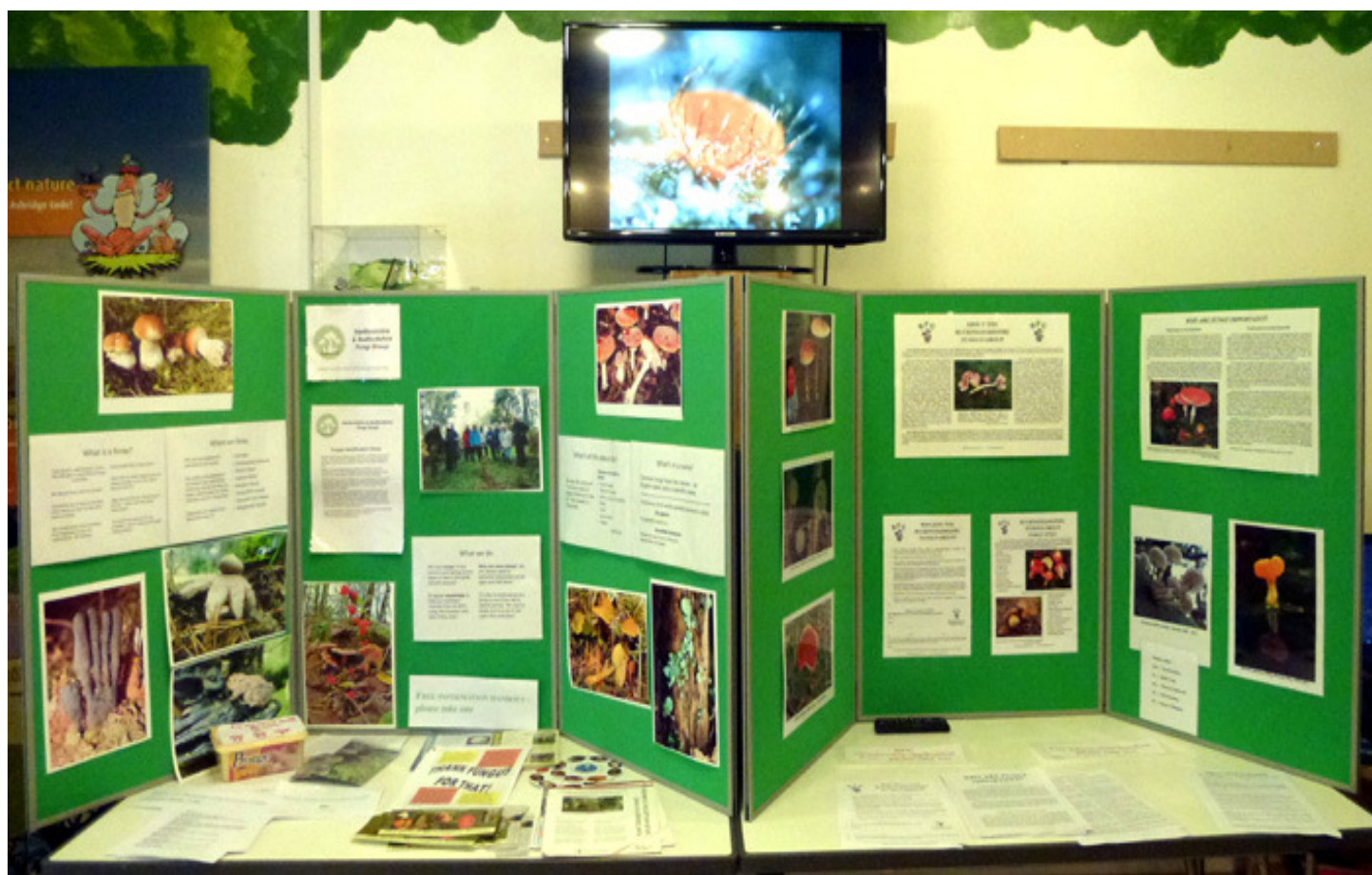
Our information boards, Herts & Beds Fungi Group left, and Bucks Fungus Group right, with TV screen above showing a constant stream of fungi photos.