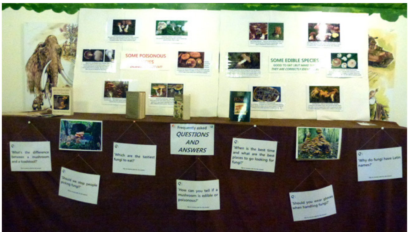
Another display board with information about a selection of edible and poisonous species, and beneath it some commonly asked questions with their answers.