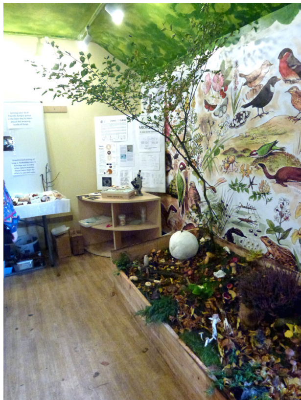
The woodland scene (left and above) together with real beech tree and large log, showing a mix of fresh specimens and models. Some of our photos can be seen to the right. (The birds on the left were a permanent fixture, and though perhaps a little distracting for the purposes of our display, could not be removed!)